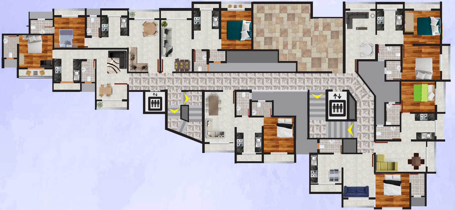
FIFTH FLOOR PLAN