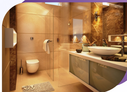
Branded Bathroom Fittings