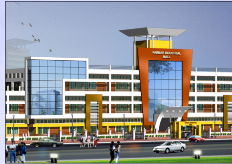
PARMAR INDUSTRIAL MALL