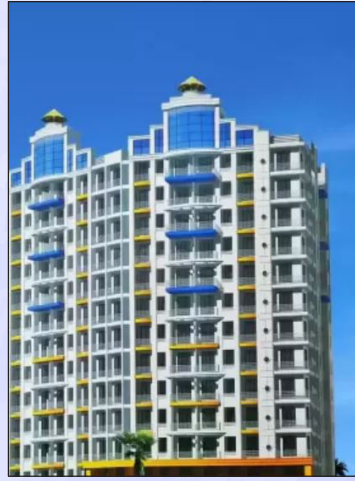
PARMAR JEWEL RESIDENCY