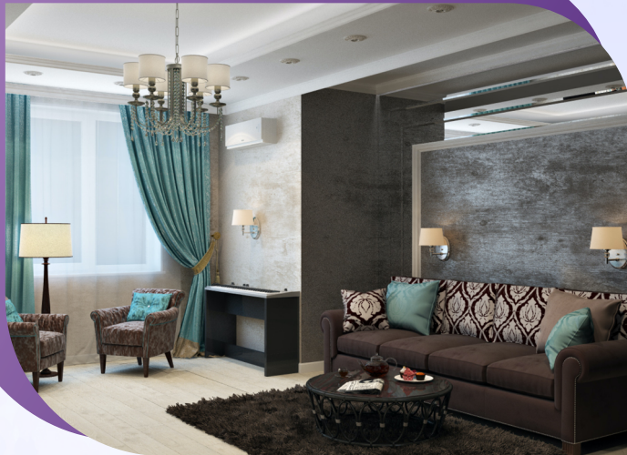
Well Planned Flats