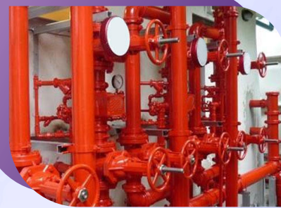
Fire Fighting systems