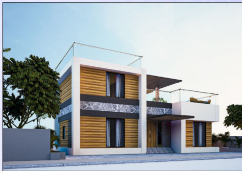
BHAKTI HOME ROYALS